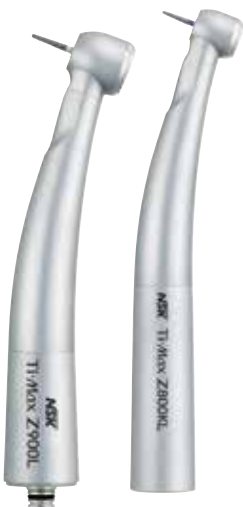
MODEL Z900L REF P1111

Optic turbine with standard head (Ø 12,5 x H 13,1 mm)