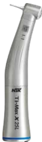
MODEL X25L REF C601