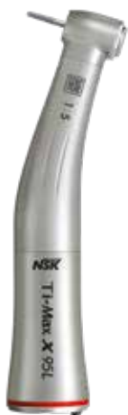
MODEL X95L REF C600

• Solid titanium body with scratch resistant DURACOAT® coating • Cellular glass optics • 2 years warranty • Clean-head-system