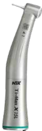
MODEL X15L REF C602